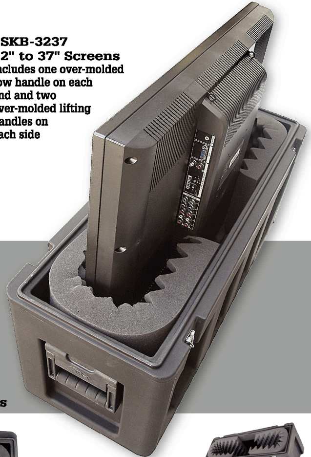
3SKB-3237 32" to 37" Screens includes one over-molded tow handle on each end and two over-molded lifting handles on each side