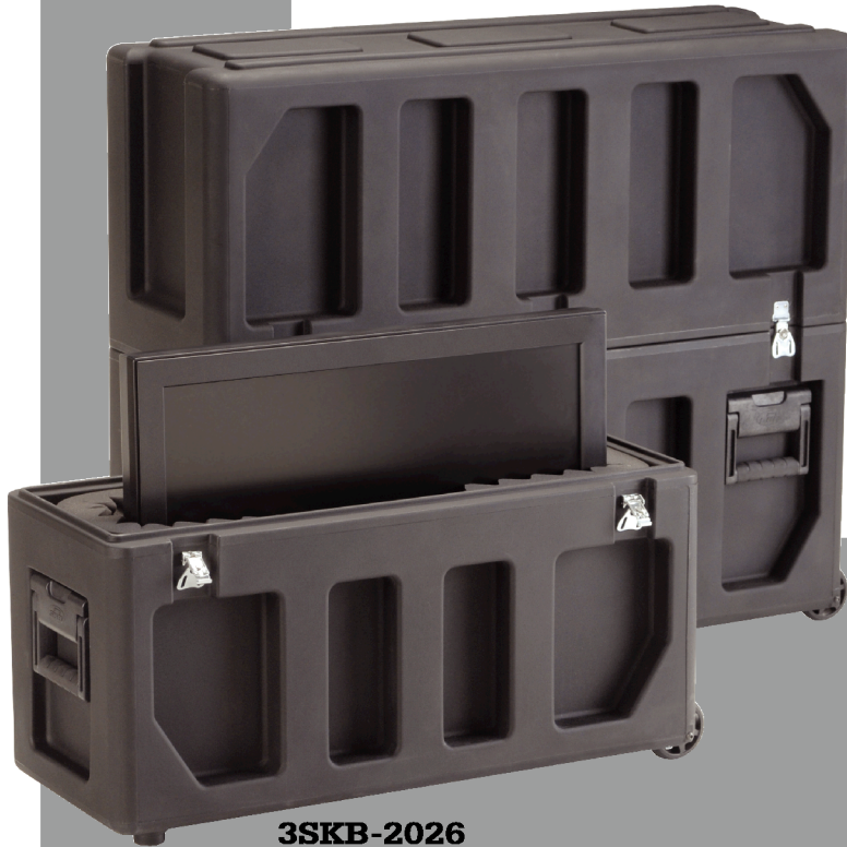
3SKB-2026 20" to 26" Screens includes two over-molded end handles